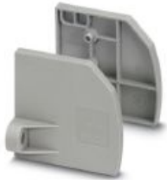
End cover, number of positions: 0, color: gray

Please be informed that the data shown in this PDF Document is generated from our Online Catalog. Please find the complete data in the user's documentation. Our General Terms of Use for Downloads are valid ( http://phoenixcontact.com/download )