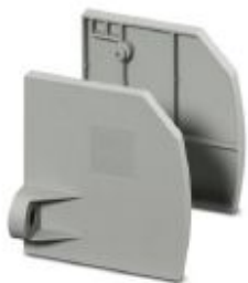
Panel feed-through terminal block, number of positions: 0, color: gray

Please be informed that the data shown in this PDF Document is generated from our Online Catalog. Please find the complete data in the user's documentation. Our General Terms of Use for Downloads are valid ( http://phoenixcontact.com/download )