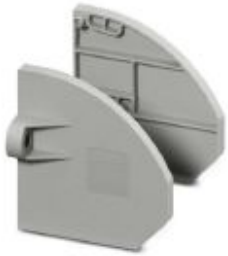
Flange, number of positions: 0, color: gray

Please be informed that the data shown in this PDF Document is generated from our Online Catalog. Please find the complete data in the user's documentation. Our General Terms of Use for Downloads are valid ( http://phoenixcontact.com/download )