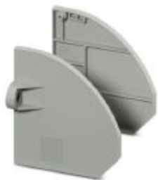
Panel feed-through terminal block, number of positions: 0, color: gray

Please be informed that the data shown in this PDF Document is generated from our Online Catalog. Please find the complete data in the user's documentation. Our General Terms of Use for Downloads are valid ( http://phoenixcontact.com/download )