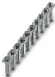
Fixed bridge, pitch: 17 mm, number of positions: 10, color: silver

Please be informed that the data shown in this PDF Document is generated from our Online Catalog. Please find the complete data in the user's documentation. Our General Terms of Use for Downloads are valid ( http://phoenixcontact.com/download )