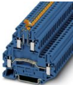
Knife disconnect terminal block, for mounting on NS 35..., color: blue, with test socket screws

Please be informed that the data shown in this PDF Document is generated from our Online Catalog. Please find the complete data in the user's documentation. Our General Terms of Use for Downloads are valid ( http://phoenixcontact.com/download )