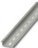
DIN rail perforated, Standard profile, width: 35 mm, height: 7.5 mm, acc. to EN 60715, material: Steel, galvanized, passivated with a thick layer, length: 2000 mm, color: silver

DIN rail perforated - NS 35/ 7,5 PERF 2000MM - 0801733