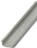
DIN rail, unperforated, Standard profile, width: 35 mm, height: 7.5 mm, acc. to EN 60715, material: Steel, galvanized, passivated with a thick layer, length: 2000 mm, color: silver

DIN rail, unperforated - NS 35/ 7,5 UNPERF 2000MM - 0801681