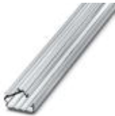
Cover profile, length: 300 mm, color: transparent