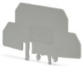
Separating plate, length: 103 mm, width: 2 mm, height: 70.1 mm, color: gray

Please be informed that the data shown in this PDF Document is generated from our Online Catalog. Please find the complete data in the user's documentation. Our General Terms of Use for Downloads are valid ( http://phoenixcontact.com/download )