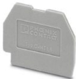
End cover, length: 22 mm, width: 1 mm, height: 17.7 mm, color: gray

Please be informed that the data shown in this PDF Document is generated from our Online Catalog. Please find the complete data in the user's documentation. Our General Terms of Use for Downloads are valid ( http://phoenixcontact.com/download )