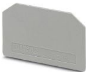
End cover, length: 46 mm, width: 1 mm, height: 28.7 mm, color: gray

Please be informed that the data shown in this PDF Document is generated from our Online Catalog. Please find the complete data in the user's documentation. Our General Terms of Use for Downloads are valid ( http://phoenixcontact.com/download )