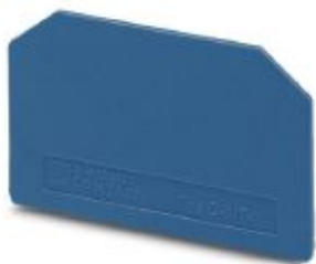
End cover, length: 46.2 mm, width: 1 mm, height: 28.3 mm, color: blue

Please be informed that the data shown in this PDF Document is generated from our Online Catalog. Please find the complete data in the user's documentation. Our General Terms of Use for Downloads are valid ( http://phoenixcontact.com/download )