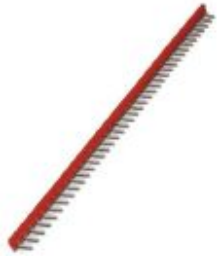
Insertion bridge, divisible, 80-pos., insulation material: Red

Please be informed that the data shown in this PDF Document is generated from our Online Catalog. Please find the complete data in the user's documentation. Our General Terms of Use for Downloads are valid ( http://phoenixcontact.com/download )