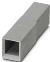
Connector housing, number of positions: 1, color: gray

Please be informed that the data shown in this PDF Document is generated from our Online Catalog. Please find the complete data in the user's documentation. Our General Terms of Use for Downloads are valid ( http://phoenixcontact.com/download )