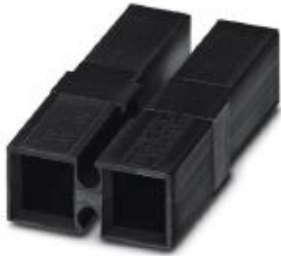
Connector housing, number of positions: 2, color: black

Please be informed that the data shown in this PDF Document is generated from our Online Catalog. Please find the complete data in the user's documentation. Our General Terms of Use for Downloads are valid ( http://phoenixcontact.com/download )