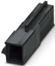
Connector housing, number of positions: 1, color: black

Please be informed that the data shown in this PDF Document is generated from our Online Catalog. Please find the complete data in the user's documentation. Our General Terms of Use for Downloads are valid ( http://phoenixcontact.com/download )