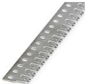
Potential busbar, with slotted 6.3/2.8 mm flat connectors, max. 40 A, brass, tin-plated, length: 1 m

Please be informed that the data shown in this PDF Document is generated from our Online Catalog. Please find the complete data in the user's documentation. Our General Terms of Use for Downloads are valid ( http://phoenixcontact.com/download )