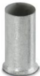
Ferrule, length: 15 mm, color: silver

Please be informed that the data shown in this PDF Document is generated from our Online Catalog. Please find the complete data in the user's documentation. Our General Terms of Use for Downloads are valid ( http://phoenixcontact.com/download )