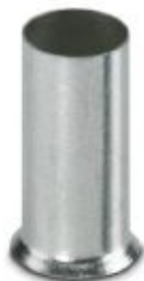
Ferrule, length: 18 mm, color: silver

Please be informed that the data shown in this PDF Document is generated from our Online Catalog. Please find the complete data in the user's documentation. Our General Terms of Use for Downloads are valid ( http://phoenixcontact.com/download )