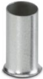
Ferrule, length: 12 mm, color: silver

Please be informed that the data shown in this PDF Document is generated from our Online Catalog. Please find the complete data in the user's documentation. Our General Terms of Use for Downloads are valid ( http://phoenixcontact.com/download )