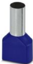
Ferrule, sleeve length: 16 mm, length: 31 mm, color: blue

Please be informed that the data shown in this PDF Document is generated from our Online Catalog. Please find the complete data in the user's documentation. Our General Terms of Use for Downloads are valid ( http://phoenixcontact.com/download )