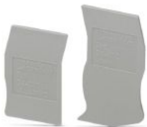
Cover segment, length: 94 mm, height: 39.3 mm, color: gray

Please be informed that the data shown in this PDF Document is generated from our Online Catalog. Please find the complete data in the user's documentation. Our General Terms of Use for Downloads are valid ( http://phoenixcontact.com/download )