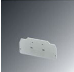
End cover, length: 72.5 mm, width: 2.2 mm, height: 43.5 mm, color: gray

Please be informed that the data shown in this PDF Document is generated from our Online Catalog. Please find the complete data in the user's documentation. Our General Terms of Use for Downloads are valid ( http://phoenixcontact.com/download )