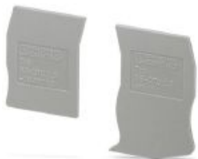
Cover segment, length: 72 mm, height: 36.5 mm, color: gray

Please be informed that the data shown in this PDF Document is generated from our Online Catalog. Please find the complete data in the user's documentation. Our General Terms of Use for Downloads are valid ( http://phoenixcontact.com/download )