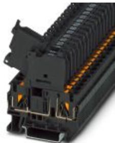
Lever-type fuse terminal block, black, for 5 x 20 mm G fuse inserts, with LED for 60 V DC

Please be informed that the data shown in this PDF Document is generated from our Online Catalog. Please find the complete data in the user's documentation. Our General Terms of Use for Downloads are valid ( http://phoenixcontact.com/download )