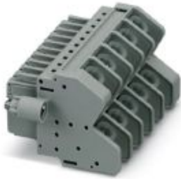
Plug for five current transformers, each with leading transformer short circuit

Please be informed that the data shown in this PDF Document is generated from our Online Catalog. Please find the complete data in the user's documentation. Our General Terms of Use for Downloads are valid ( http://phoenixcontact.com/download )