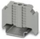
End clamp, width: 9.5 mm, color: gray