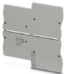
End cover, length: 74.9 mm, width: 2.2 mm, height: 36.8 mm, color: gray

Please be informed that the data shown in this PDF Document is generated from our Online Catalog. Please find the complete data in the user's documentation. Our General Terms of Use for Downloads are valid ( http://phoenixcontact.com/download )