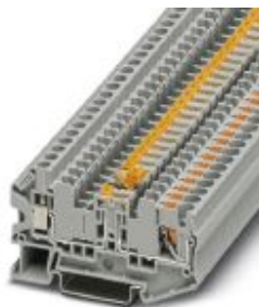
Knife disconnect terminal block, connection method: Push-in connection, Screw connection, cross section: 0.2 mm² - 6 mm², AWG: 24 - 12, width: 6.2 mm, color: gray, mounting: NS 35/7,5, NS 35/15

Please be informed that the data shown in this PDF Document is generated from our Online Catalog. Please find the complete data in the user's documentation. Our General Terms of Use for Downloads are valid ( http://phoenixcontact.com/download )