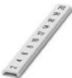
Zack Marker strip, flat, Strip, white, labeled, printed horizontally: consecutive numbers 2 ... 20, 22 ... 40, etc. up to 82 ... 100, mounting type: snap into flat marker groove, for terminal block width: 5 mm, lettering field size: 5.15 x 5.15 mm, Number of individual labels: 10

Zack Marker strip, flat - ZBF 5,LGS:GERADE ZAHLEN - 0810821