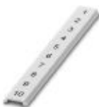
Zack Marker strip, flat, Strip, white, labeled, Printed vertically: consecutive numbers 1 ... 10, 11 ... 20, etc. up to 91 ... 100, mounting type: snap into flat marker groove, for terminal block width: 5 mm, lettering field size: 5.15 x 5.15 mm, Number of individual labels: 10

Zack Marker strip, flat - ZBF 5,QR:FORTL.ZAHLEN - 0808697