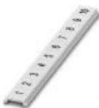
Zack Marker strip, flat, Strip, white, labeled, printed horizontally: consecutive numbers 1 ... 10, 11 ... 20, etc. up to 491 ... 500, mounting type: snap into flat marker groove, for terminal block width: 5 mm, lettering field size: 5.15 x 5.15 mm, Number of individual labels: 10

Zack Marker strip, flat - ZBF 5,LGS:FORTL.ZAHLEN - 0808671