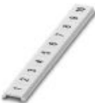
Zack Marker strip, flat, Strip, white, labeled, printed horizontally: consecutive numbers 1 ... 10, 11 ... 20, etc. up to 491 ... 500, mounting type: snap into flat marker groove, for terminal block width: 5 mm, lettering field size: 5.15 x 5.15 mm, Number of individual labels: 10

Zack Marker strip, flat - ZBF 5,LGS:FORTL.ZAHLEN - 0808671