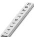
Zack Marker strip, flat, Strip, white, labeled, printed horizontally: consecutive numbers 2 ... 20, 22 ... 40, etc. up to 82 ... 100, mounting type: snap into flat marker groove, for terminal block width: 5 mm, lettering field size: 5.15 x 5.15 mm, Number of individual labels: 10

Zack Marker strip, flat - ZBF 5,LGS:GERADE ZAHLEN - 0810821