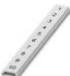
Zack Marker strip, flat, Strip, white, labeled, Printed vertically: consecutive numbers 1 ... 10, 11 ... 20, etc. up to 91 ... 100, mounting type: snap into flat marker groove, for terminal block width: 5 mm, lettering field size: 5.15 x 5.15 mm, Number of individual labels: 10

Zack Marker strip, flat - ZBF 5,QR:FORTL.ZAHLEN - 0808697