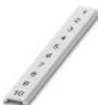
Zack Marker strip, flat, Strip, white, labeled, Printed vertically: consecutive numbers 1 ... 10, 11 ... 20, etc. up to 91 ... 100, mounting type: snap into flat marker groove, for terminal block width: 5 mm, lettering field size: 5.15 x 5.15 mm, Number of individual labels: 10

Zack Marker strip, flat - ZBF 5,QR:FORTL.ZAHLEN - 0808697