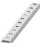
Zack Marker strip, flat, Strip, white, labeled, printed horizontally: consecutive numbers 1 ... 10, 11 ... 20, etc. up to 491 ... 500, mounting type: snap into flat marker groove, for terminal block width: 5 mm, lettering field size: 5.15 x 5.15 mm, Number of individual labels: 10

Zack Marker strip, flat - ZBF 5,LGS:FORTL.ZAHLEN - 0808671