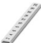
Zack Marker strip, flat, Strip, white, labeled, printed horizontally: consecutive numbers 2 ... 20, 22 ... 40, etc. up to 82 ... 100, mounting type: snap into flat marker groove, for terminal block width: 5 mm, lettering field size: 5.15 x 5.15 mm, Number of individual labels: 10

Zack Marker strip, flat - ZBF 5,LGS:GERADE ZAHLEN - 0810821