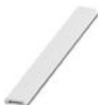
Zack Marker strip, flat, can be ordered: Strip, white, labeled according to customer specifications, mounting type: snap into flat marker groove, for terminal block width: 5 mm, lettering field size: 5.15 x 5.15 mm, Number of individual labels: 10

Zack Marker strip, flat - ZBF 5 CUS - 0825025