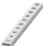
Zack Marker strip, flat, Strip, white, labeled, printed horizontally: consecutive numbers 2 ... 20, 22 ... 40, etc. up to 82 ... 100, mounting type: snap into flat marker groove, for terminal block width: 5 mm, lettering field size: 5.15 x 5.15 mm, Number of individual labels: 10

Zack Marker strip, flat - ZBF 5,LGS:GERADE ZAHLEN - 0810821