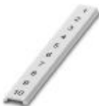
Zack Marker strip, flat, Strip, white, labeled, Printed vertically: consecutive numbers 1 ... 10, 11 ... 20, etc. up to 91 ... 100, mounting type: snap into flat marker groove, for terminal block width: 5 mm, lettering field size: 5.15 x 5.15 mm, Number of individual labels: 10

Zack Marker strip, flat - ZBF 5,QR:FORTL.ZAHLEN - 0808697