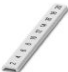
Zack Marker strip, flat, Strip, white, labeled, printed horizontally: consecutive numbers 2 ... 20, 22 ... 40, etc. up to 82 ... 100, mounting type: snap into flat marker groove, for terminal block width: 5 mm, lettering field size: 5.15 x 5.15 mm, Number of individual labels: 10

Zack Marker strip, flat - ZBF 5,LGS:GERADE ZAHLEN - 0810821