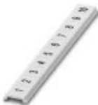
Zack Marker strip, flat, Strip, white, labeled, printed horizontally: consecutive numbers 1 ... 10, 11 ... 20, etc. up to 491 ... 500, mounting type: snap into flat marker groove, for terminal block width: 5 mm, lettering field size: 5.15 x 5.15 mm, Number of individual labels: 10

Zack Marker strip, flat - ZBF 5,LGS:FORTL.ZAHLEN - 0808671