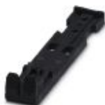
Strain relief, length: 48.7 mm, width: 9.3 mm, number of positions: 2, color: black