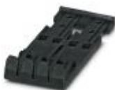
Strain relief, length: 48.7 mm, width: 19.6 mm, number of positions: 4, color: black