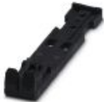
Strain relief, length: 48.7 mm, width: 9.3 mm, number of positions: 2, color: black