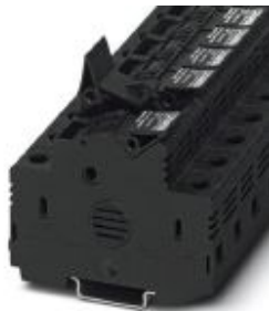
Fuse terminal block with light indicator, for cartridge fuse insert 10.3 x 38 mm, cross section: 1.5 - 25 mm 2 , AWG: 16 - 4, width: 18 mm, color: Black

Please be informed that the data shown in this PDF Document is generated from our Online Catalog. Please find the complete data in the user's documentation. Our General Terms of Use for Downloads are valid ( http://phoenixcontact.com/download )