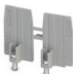
Flange cover, length: 35.8 mm, width: 4.5 mm, height: 24.7 mm, color: gray