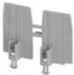
Flange cover, length: 35.8 mm, width: 4.5 mm, height: 24.7 mm, color: gray