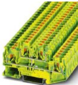
Protective conductor double-level terminal block, connection method: Push-in connection, cross section: 0.2 mm 2 - 6 mm 2 , AWG: 24 - 10, width: 6.2 mm, color: green-yellow, mounting type: NS 35/7,5, NS 35/15

Please be informed that the data shown in this PDF Document is generated from our Online Catalog. Please find the complete data in the user's documentation. Our General Terms of Use for Downloads are valid ( http://phoenixcontact.com/download )