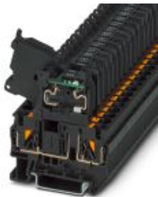
Lever-type fuse terminal block, black, for 5 x 20 mm G fuse inserts, with LED for 24 V AC/DC

Please be informed that the data shown in this PDF Document is generated from our Online Catalog. Please find the complete data in the user's documentation. Our General Terms of Use for Downloads are valid ( http://phoenixcontact.com/download )