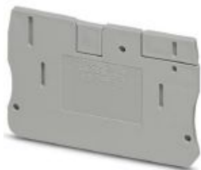
End cover, length: 57.7 mm, width: 2.2 mm, height: 36 mm, color: gray

Please be informed that the data shown in this PDF Document is generated from our Online Catalog. Please find the complete data in the user's documentation. Our General Terms of Use for Downloads are valid ( http://phoenixcontact.com/download )