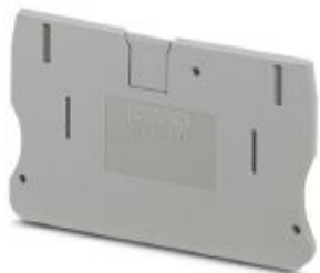
End cover, length: 67.7 mm, width: 2.2 mm, height: 42.6 mm, color: gray

Please be informed that the data shown in this PDF Document is generated from our Online Catalog. Please find the complete data in the user's documentation. Our General Terms of Use for Downloads are valid ( http://phoenixcontact.com/download )