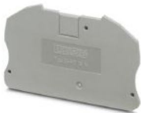
End cover, length: 75.4 mm, width: 2.2 mm, height: 45.6 mm, color: gray

Please be informed that the data shown in this PDF Document is generated from our Online Catalog. Please find the complete data in the user's documentation. Our General Terms of Use for Downloads are valid ( http://phoenixcontact.com/download )