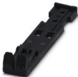
Strain relief, length: 44.5 mm, width: 6.8 mm, number of positions: 2, color: black

Please be informed that the data shown in this PDF Document is generated from our Online Catalog. Please find the complete data in the user's documentation. Our General Terms of Use for Downloads are valid ( http://phoenixcontact.com/download )