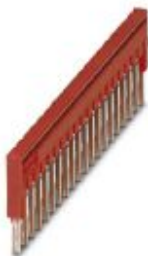
Plug-in bridge, pitch: 3.5 mm, number of positions: 20, color: red

Please be informed that the data shown in this PDF Document is generated from our Online Catalog. Please find the complete data in the user's documentation. Our General Terms of Use for Downloads are valid ( http://phoenixcontact.com/download )