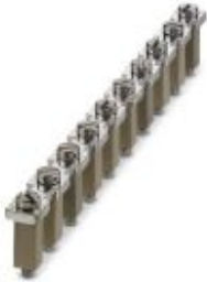
Fixed bridge, pitch: 17 mm, number of positions: 10, color: silver

Please be informed that the data shown in this PDF Document is generated from our Online Catalog. Please find the complete data in the user's documentation. Our General Terms of Use for Downloads are valid ( http://phoenixcontact.com/download )