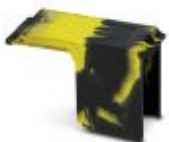
Covering hood, length: 85.6 mm, width: 28.8 mm, height: 46.7 mm, color: black/yellow