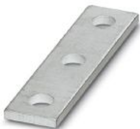
Connection rail, number of positions: 3, color: silver

Please be informed that the data shown in this PDF Document is generated from our Online Catalog. Please find the complete data in the user's documentation. Our General Terms of Use for Downloads are valid ( http://phoenixcontact.com/download )