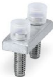
Fixed bridge, pitch: 20 mm, number of positions: 2, color: silver

Please be informed that the data shown in this PDF Document is generated from our Online Catalog. Please find the complete data in the user's documentation. Our General Terms of Use for Downloads are valid ( http://phoenixcontact.com/download )