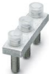
Fixed bridge, pitch: 20 mm, number of positions: 3, color: silver

Please be informed that the data shown in this PDF Document is generated from our Online Catalog. Please find the complete data in the user's documentation. Our General Terms of Use for Downloads are valid ( http://phoenixcontact.com/download )